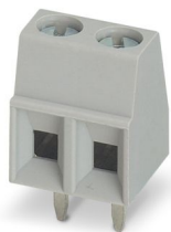
The figure shows the gray version

PCB terminal block, nominal current: 13.5 A, rated voltage (III/2): 200 V, nominal cross section: 1.5 mm 2 , number of potentials: 2, number of rows: 1, number of positions per row: 2, product range: BC-X9, pitch: 3.81 mm, connection method: Screw connection with tension sleeve, screw head form: L Slotted, mounting: Wave soldering, conductor/PCB connection direction: 0 °, color: black, Pin layout: Linear pinning, Solder pin [P]: 3.5 mm, number of solder pins per potential: 1, type of packaging: packed in cardboard