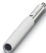
Test plug strip, number of positions: 1, color: gray

Please be informed that the data shown in this PDF document is generated from our online catalog. Please find the complete data in the user documentation. Our general terms of use for downloads are valid.