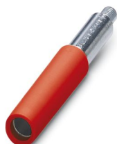
Test plug strip, number of positions: 1, color: red

Please be informed that the data shown in this PDF document is generated from our online catalog. Please find the complete data in the user documentation. Our general terms of use for downloads are valid.