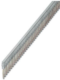
Plug-in bridge, pitch: 5.2 mm, number of positions: 50, nominal current: 24 A, color: gray

Please be informed that the data shown in this PDF document is generated from our online catalog. Please find the complete data in the user documentation. Our general terms of use for downloads are valid.