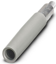
Test plug strip, number of positions: 1, color: gray

Please be informed that the data shown in this PDF document is generated from our online catalog. Please find the complete data in the user documentation. Our general terms of use for downloads are valid.