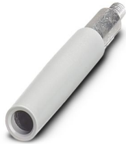
Test plug strip, number of positions: 1, color: transparent

Please be informed that the data shown in this PDF document is generated from our online catalog. Please find the complete data in the user documentation. Our general terms of use for downloads are valid.