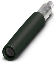
Test plug strip, number of positions: 1, color: black

Please be informed that the data shown in this PDF document is generated from our online catalog. Please find the complete data in the user documentation. Our general terms of use for downloads are valid.