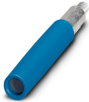
Test plug strip, number of positions: 1, color: blue

Please be informed that the data shown in this PDF document is generated from our online catalog. Please find the complete data in the user documentation. Our general terms of use for downloads are valid.