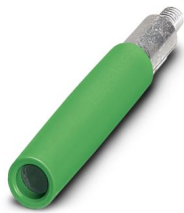
Test plug strip, number of positions: 1, color: green

Please be informed that the data shown in this PDF document is generated from our online catalog. Please find the complete data in the user documentation. Our general terms of use for downloads are valid.