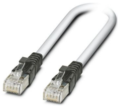
Patch cable, CAT5, assembled, 1 m

https://www.phoenixcontact.com/us/products/2832276