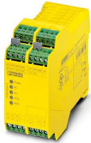
The figure shows a version of the product

Please be informed that the data shown in this PDF document is generated from our online catalog. Please find the complete data in the user documentation. Our general terms of use for downloads are valid.