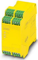
The figure shows a version with a screw connection

Please be informed that the data shown in this PDF document is generated from our online catalog. Please find the complete data in the user documentation. Our general terms of use for downloads are valid.