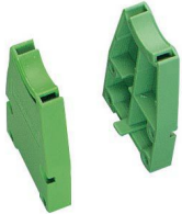
The figure shows version UM 25-SEK

Please be informed that the data shown in this PDF document is generated from our online catalog. Please find the complete data in the user documentation. Our general terms of use for downloads are valid.