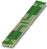
PCB for assembling electronic components

Please be informed that the data shown in this PDF document is generated from our online catalog. Please find the complete data in the user documentation. Our general terms of use for downloads are valid.