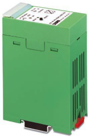
The figure shows version EG 45-PS-120AC/ 24DC/250

Please be informed that the data shown in this PDF document is generated from our online catalog. Please find the complete data in the user documentation. Our general terms of use for downloads are valid.