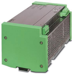
Power supply unit, primary switched-mode, input 3 x 400 V AC, output 24 V DC/20 A

Please be informed that the data shown in this PDF document is generated from our online catalog. Please find the complete data in the user documentation. Our general terms of use for downloads are valid.