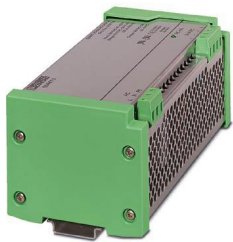
Power supply unit, primary switched-mode, input 120 V AC, output 24 V DC/5 A

Please be informed that the data shown in this PDF document is generated from our online catalog. Please find the complete data in the user documentation. Our general terms of use for downloads are valid.