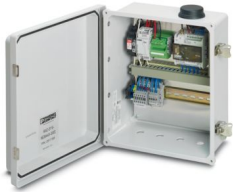
NEMA 4X enclosure for SMS relay

Please be informed that the data shown in this PDF document is generated from our online catalog. Please find the complete data in the user documentation. Our general terms of use for downloads are valid.