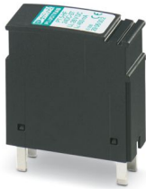
PT protective plug with HF protective circuit for 4 signal wires. Nominal voltage: 24 V DC

Please be informed that the data shown in this PDF document is generated from our online catalog. Please find the complete data in the user documentation. Our general terms of use for downloads are valid.