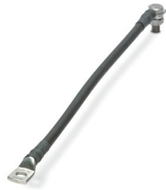
Connecting cable for FLT-ISG-100-EX, length 300 mm.

Please be informed that the data shown in this PDF document is generated from our online catalog. Please find the complete data in the user documentation. Our general terms of use for downloads are valid.