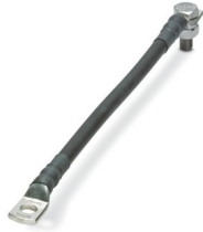
Connecting cable for FLT-ISG-100-EX, length 200 mm.

Please be informed that the data shown in this PDF document is generated from our online catalog. Please find the complete data in the user documentation. Our general terms of use for downloads are valid.