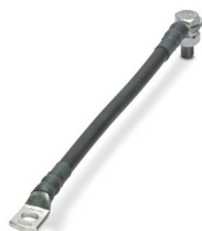
Connecting cable for FLT-ISG-100-EX, length 200 mm.

Please be informed that the data shown in this PDF document is generated from our online catalog. Please find the complete data in the user documentation. Our general terms of use for downloads are valid.