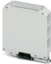
Product photo shows a standard item

Please be informed that the data shown in this PDF document is generated from our online catalog. Please find the complete data in the user documentation. Our general terms of use for downloads are valid.