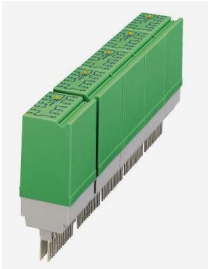
The figure shows version ST-REL 7-HG 24/4X21

Please be informed that the data shown in this PDF document is generated from our online catalog. Please find the complete data in the user documentation. Our general terms of use for downloads are valid.