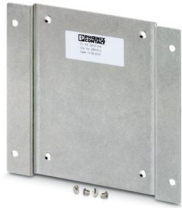
Mounting plate for SFNT switches

Please be informed that the data shown in this PDF document is generated from our online catalog. Please find the complete data in the user documentation. Our general terms of use for downloads are valid.