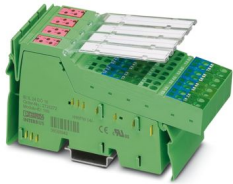
The figure shows the article IB IL 24 DO 16-PAC

Please be informed that the data shown in this PDF document is generated from our online catalog. Please find the complete data in the user documentation. Our general terms of use for downloads are valid.