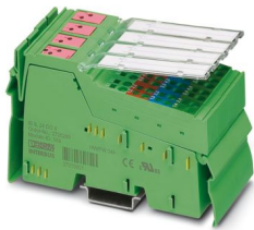
The figure shows the version IB IL 24 DO 8-PAC

Please be informed that the data shown in this PDF document is generated from our online catalog. Please find the complete data in the user documentation. Our general terms of use for downloads are valid.