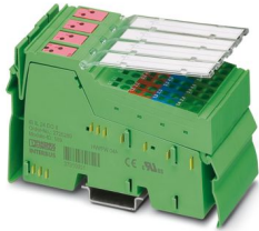
The figure shows the version IB IL 24 DO 8-PAC

Please be informed that the data shown in this PDF document is generated from our online catalog. Please find the complete data in the user documentation. Our general terms of use for downloads are valid.