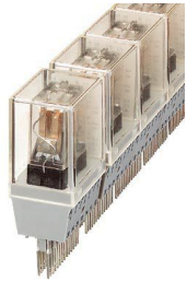
The figure shows version ST-REL 7-SG 24/4X21

Please be informed that the data shown in this PDF document is generated from our online catalog. Please find the complete data in the user documentation. Our general terms of use for downloads are valid.