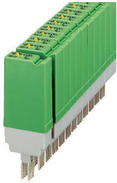
The figure shows version ST-REL 2-KG 24/2

Please be informed that the data shown in this PDF document is generated from our online catalog. Please find the complete data in the user documentation. Our general terms of use for downloads are valid.