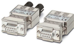
The figure shows version OPTOSUB-PLUS-G/OUT and OPTOSUB-PLUS-K/OUT

Please be informed that the data shown in this PDF document is generated from our online catalog. Please find the complete data in the user documentation. Our general terms of use for downloads are valid.