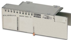
The figure shows version IBS RL 24 BK RB-LK-LK

Bus coupler with remote branch for INTERBUS; fiber-optic technology with 2 Mbaud, rugged metal housing with IP67 degree of protection, tool-free mounting on a separate mounting panel, can be used directly on welding robots