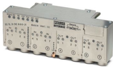
The figure shows version IBS RL 24 DIO 8/8/8-LK

Digital I/O device for INTERBUS; fiber optic technology with 2 Mbaud, eight inputs (24 V DC), eight outputs (24 V DC, 0.5 A), sensor/actuator connection via 5-pos. M12 female connectors, rugged metal housing, IP67 protection