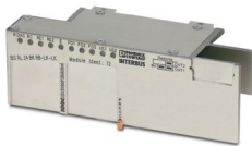
The figure shows version IBS RL 24 BK RB-LK-LK

Bus coupler with remote bus branch for INTERBUS; twisted pair with 500 kBaud, rugged metal housing with IP67 degree of protection, tool-free mounting on a separate mounting panel, can be used directly on welding robots