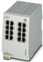
The figure shows a version of the product

Please be informed that the data shown in this PDF document is generated from our online catalog. Please find the complete data in the user documentation. Our general terms of use for downloads are valid.