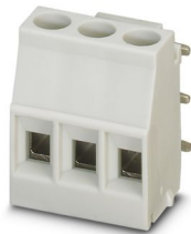
Figure shows standard item in light gray

PCB terminal block, nominal current: 24 A, rated voltage (III/2): 400 V, nominal cross section: 2.5 mm 2 , number of rows: 1, number of positions per row: 3, product range: MKDSO 2,5/..-R, pitch: 5 mm, connection method: Screw connection with tension sleeve, mounting: Wave soldering, conductor/PCB connection direction: 0 °, color: beige, Pin layout: Linear pinning, Solder pin [P]: 3.5 mm, number of solder pins per potential: 1, type of packaging: packed in cardboard. Product with pin output on right side