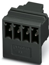
The figure shows the standard item

PCB headers, nominal cross section: 1.5 mm 2 , color: black, nominal current: 8 A, rated voltage (III/2): 160 V, contact surface: Sn, contact connection type: Pin, number of rows: 1, number of positions: 4, product range: MCO 1,5/...-G1L, pitch: 3.5 mm, mounting: Wave soldering, pin layout: Linear pinning, solder pin [P]: 2.75 mm, number of solder pins per potential: 1, plug-in system: COMBICON MC 1,5, Pin connector pattern alignment: Orthogonal, locking: without, type of packaging: packed in cardboard, Fixed coding of the position: 3, item with lateral pin outlet on the left