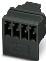
The figure shows the standard item

PCB headers, nominal cross section: 1.5 mm 2 , color: black, nominal current: 8 A, rated voltage (III/2): 160 V, contact surface: Sn, contact connection type: Pin, number of rows: 1, number of positions: 4, product range: MCO 1,5/...-G1L, pitch: 3.5 mm, mounting: Wave soldering, pin layout: Linear pinning, solder pin [P]: 2.75 mm, number of solder pins per potential: 1, plug-in system: COMBICON MC 1,5, Pin connector pattern alignment: Orthogonal, locking: without, type of packaging: packed in cardboard, Fixed coding of the position: 3, item with lateral pin outlet on the left