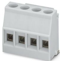
Figure shows standard item in light gray

Printed circuit board terminal, nominal current: 24 A, rated voltage (III/2): 400 V, nominal cross section: 2.5 mm 2 , number of potentials: 4, number of rows: 1, number of positions per row: 4, product range: MKDSO 2,5/...-L, pitch: 5 mm, connection method: Screw connection with tension sleeve, mounting: Wave soldering, conductor/PCB connection direction: 0 °, color: gray, Pin layout: Linear pinning, Solder pin [P]: 3.5 mm, number of solder pins per potential: 1, type of packaging: packed in cardboard. Printed version, item with lateral pin outlet on the left