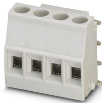
Figure shows standard item in light gray

Printed circuit board terminal, nominal current: 24 A, rated voltage (III/2): 400 V, nominal cross section: 2.5 mm 2 , number of potentials: 4, number of rows: 1, number of positions per row: 4, product range: MKDSO 2,5/...-R, pitch: 5 mm, connection method: Screw connection with tension sleeve, mounting: Wave soldering, conductor/PCB connection direction: 0 °, color: light gray, Pin layout: Linear pinning, Solder pin [P]: 3.5 mm, number of solder pins per potential: 1, type of packaging: packed in cardboard. Printed version, item with pin output on the right