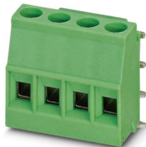
The figure shows a standard item

Printed circuit board terminal, nominal current: 24 A, rated voltage (III/2): 400 V, nominal cross section: 2.5 mm 2 , number of potentials: 4, number of rows: 1, number of positions per row: 4, product range: MKDSO 2,5/...-R, pitch: 5 mm, connection method: Screw connection with tension sleeve, mounting: Wave soldering, conductor/PCB connection direction: 0 °, color: green, Pin layout: Linear pinning, Solder pin [P]: 3.5 mm, number of solder pins per potential: 1, type of packaging: packed in cardboard. Product with pin output on right side