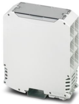
Figure shows housing version ME MAX 35 LC 3-3

Please be informed that the data shown in this PDF document is generated from our online catalog. Please find the complete data in the user documentation. Our general terms of use for downloads are valid.