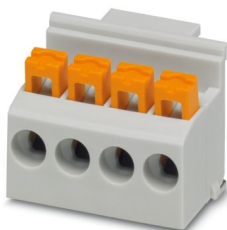
The figure shows a version of the article

PCB terminal block, nominal current: 22 A, rated voltage (III/2): 250 V, nominal cross section: 2.5 mm 2 , number of potentials: 4, number of rows: 1, number of positions per row: 4, product range: FKDSO 2,5/..-L, pitch: 5 mm, connection method: Push-in spring connection, mounting: Wave soldering, conductor/PCB connection direction: 0 °, color: green, Pin layout: Linear pinning, Solder pin [P]: 3.5 mm, number of solder pins per potential: 1. Printed version, item with lateral pin outlet on the left