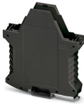
The figure shows a version of the item without vents

Please be informed that the data shown in this PDF document is generated from our online catalog. Please find the complete data in the user documentation. Our general terms of use for downloads are valid.