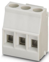
The product photo shows a reference item

PCB terminal block, nominal current: 24 A, rated voltage (III/2): 400 V, nominal cross section: 2.5 mm 2 , number of potentials: 3, number of rows: 1, number of positions per row: 3, product range: MKDSO 2,5/...-L, pitch: 5 mm, connection method: Screw connection with tension sleeve, mounting: Wave soldering, conductor/PCB connection direction: 0 °, color: light gray, Pin layout: Linear pinning, Solder pin [P]: 3.5 mm, number of solder pins per potential: 1, type of packaging: packed in cardboard. Product with pin output on left side