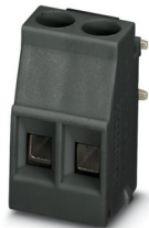
The figure shows the standard item

Printed circuit board terminal, nominal current: 24 A, rated voltage (III/2): 400 V, nominal cross section: 2.5 mm 2 , number of potentials: 2, number of rows: 1, number of positions per row: 2, product range: MKDSO 2,5/..-R, pitch: 5 mm, connection method: Screw connection with tension sleeve, mounting: Wave soldering, conductor/PCB connection direction: 0 °, color: black, Pin layout: Linear pinning, Solder pin [P]: 3.5 mm, number of solder pins per potential: 1, type of packaging: packed in cardboard. Product with pin output on right side