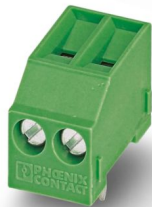
The figure shows a 2-pos. version of the product

PCB terminal block, nominal current: 24 A, rated voltage (III/2): 400 V, nominal cross section: 2.5 mm 2 , number of potentials: 3, number of rows: 1, number of positions per row: 3, product range: MKDSFW 3, pitch: 5 mm, connection method: Screw connection with tension sleeve, screw head form: L Slotted, mounting: Wave soldering, conductor/PCB connection direction: 90 °, color: black, Pin layout: Linear pinning, Solder pin [P]: 5 mm, number of solder pins per potential: 1, type of packaging: packed in cardboard