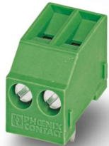
The figure shows a 2-pos. version of the product

Printed circuit board terminal, nominal current: 24 A, rated voltage (III/2): 400 V, nominal cross section: 2.5 mm 2 , number of potentials: 3, number of rows: 1, number of positions per row: 3, product range: MKDSFW 3, pitch: 5 mm, connection method: Screw connection with tension sleeve, screw head form: L Slotted, mounting: Wave soldering, conductor/PCB connection direction: 90 °, color: black, Pin layout: Linear pinning, Solder pin [P]: 5 mm, number of solder pins per potential: 1, type of packaging: packed in cardboard