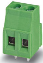
The figure shows a 2-pos. version of the product

Printed circuit board terminal, nominal current: 24 A, rated voltage (III/2): 400 V, nominal cross section: 2.5 mm 2 , number of potentials: 3, number of rows: 1, number of positions per row: 3, product range: MKDSN 2,5, pitch: 5.08 mm, connection method: Screw connection with tension sleeve, screw head form: L Slotted, mounting: Wave soldering, conductor/PCB connection direction: 0 °, color: green, Pin layout: Linear pinning, Solder pin [P]: 3.5 mm, number of solder pins per potential: 1, type of packaging: packed in cardboard