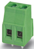
The figure shows a 2-pos. version of the product

Printed circuit board terminal, nominal current: 24 A, rated voltage (III/2): 400 V, nominal cross section: 2.5 mm 2 , number of potentials: 4, number of rows: 1, number of positions per row: 4, product range: MKDSN 2,5, pitch: 5 mm, connection method: Screw connection with tension sleeve, screw head form: H1L Slotted Phillips recess, mounting: Wave soldering, conductor/PCB connection direction: 0 °, color: green, Pin layout: Linear pinning, Solder pin [P]: 3.5 mm, number of solder pins per potential: 1, type of packaging: packed in cardboard