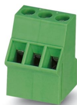
The figure shows a 3-position version

Printed circuit board terminal, nominal current: 20 A, rated voltage (III/2): 400 V, nominal cross section: 2.5 mm 2 , number of potentials: 3, number of rows: 1, number of positions per row: 3, product range: SMKDS 2,5, pitch: 5.08 mm, connection method: Screw connection with tension sleeve, screw head form: L Slotted, mounting: Wave soldering, conductor/PCB connection direction: 50 °, color: green, Pin layout: Linear pinning, Solder pin [P]: 3.5 mm, number of solder pins per potential: 1, type of packaging: packed in cardboard. The article can be aligned to create different nos. of positions!