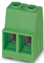
The figure shows a 2-pos. version of the product

Printed circuit board terminal, nominal current: 76 A, rated voltage (III/2): 1000 V, nominal cross section: 16 mm 2 , number of potentials: 3, number of rows: 1, number of positions per row: 3, product range: MKDSP 10HV, pitch: 10.16 mm, connection method: Screw connection with tension sleeve, screw head form: L Slotted, mounting: Wave soldering, conductor/PCB connection direction: 0 °, color: black, Pin layout: Linear pinning, Solder pin [P]: 5 mm, number of solder pins per potential: 2, type of packaging: packed in cardboard. The article can be aligned to create different nos. of positions! Equipment ratings in acc. with UL, for 600 V applications, are possible. The insulation requirements of the respective devices for PCB assembly must be observed for this purpose (e.g. UL 508).