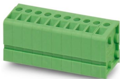
The figure shows an 10-position version

Printed circuit board terminal, nominal current: 24 A, rated voltage (III/2): 400 V, nominal cross section: 2.5 mm 2 , number of potentials: 4, number of rows: 1, number of positions per row: 4, product range: FRONT 2,5-V/SA 5, pitch: 5 mm, connection method: Front screw connection, mounting: Wave soldering, conductor/PCB connection direction: 90 °, color: green, Pin layout: Linear pinning, Solder pin [P]: 3.5 mm, number of solder pins per potential: 2, type of packaging: packed in cardboard. The article can be aligned to create different nos. of positions!