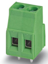
The figure shows a 2-pos. version of the product

Printed circuit board terminal, nominal current: 24 A, rated voltage (III/2): 400 V, nominal cross section: 2.5 mm 2 , number of potentials: 5, number of rows: 1, number of positions per row: 5, product range: MKDSN 2,5, pitch: 5 mm, connection method: Screw connection with tension sleeve, screw head form: H1L Slotted Phillips recess, mounting: Wave soldering, conductor/PCB connection direction: 0 °, color: green, Pin layout: Linear pinning, Solder pin [P]: 3.5 mm, number of solder pins per potential: 1, type of packaging: Tube magazine. The article can be aligned to create different nos. of positions!